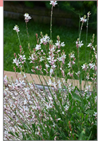
Sparkle White Gaura in bloom

Sparkle White Gaura will grow to be about 24 inches tall at maturity, with a spread of 30 inches. When grown in masses or used as a bedding plant, individual plants should be spaced approximately 24 inches apart. Its foliage tends to remain dense right to the ground, not requiring facer plants in front. It grows at a fast rate, and under ideal conditions can be expected to live for approximately 8 years. As an herbaceous perennial, this plant will usually die back to the crown each winter, and will regrow from the base each spring. Be careful not to disturb the crown in late winter when it may not be readily seen!