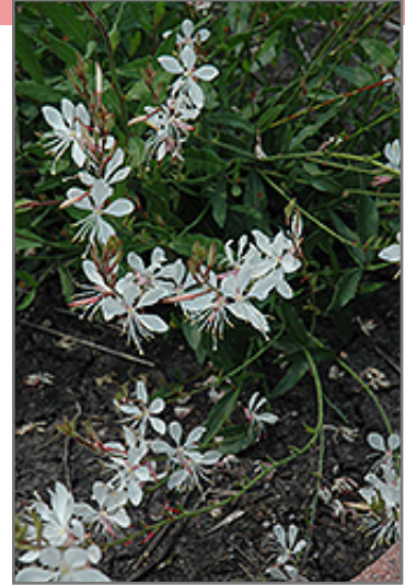
Sparkle White Gaura flowers

Sparkle White Gaura is recommended for the following landscape applications;