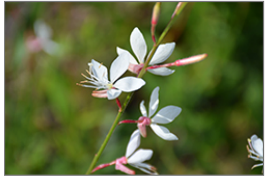
Sparkle White Gaura flowers