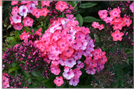
Garden Girls Glamour Girl Garden Phlox flowers

Garden Girls Glamour Girl Garden Phlox is recommended for the following landscape applications;