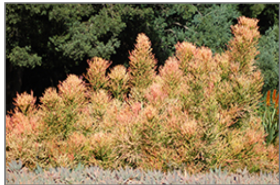
Sticks On Fire Red Pencil Tree