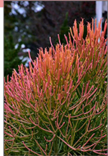
Sticks On Fire Red Pencil Tree foliage

Sticks On Fire Red Pencil Tree is recommended for the following landscape applications;