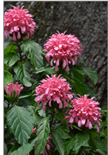
Brazilian Plume Flower flowers