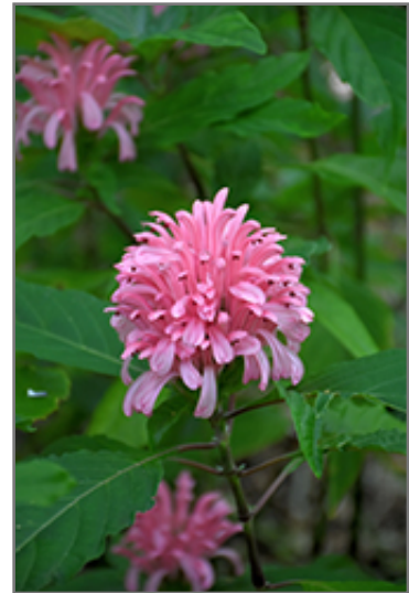
Brazilian Plume Flower flowers

Brazilian Plume Flower is a fine choice for the garden, but it is also a good selection for planting in outdoor pots and containers. With its upright habit of growth, it is best suited for use as a 'thriller' in the 'spiller-thriller-filler' container combination; plant it near the center of the pot, surrounded by smaller plants and those that spill over the edges. It is even sizeable enough that it can be grown alone in a suitable container. Note that when growing plants in outdoor containers and baskets, they may require more frequent waterings than they would in the yard or garden.