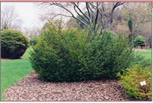
Canadian Yew

An uncommon native evergreen shrub with a bushy and sprawling habit of growth, dark green foliage tends to turn reddish-brown in winter; very hardy but requires winter shade and reliable snow cover, makes a good large groundcover for shady parts