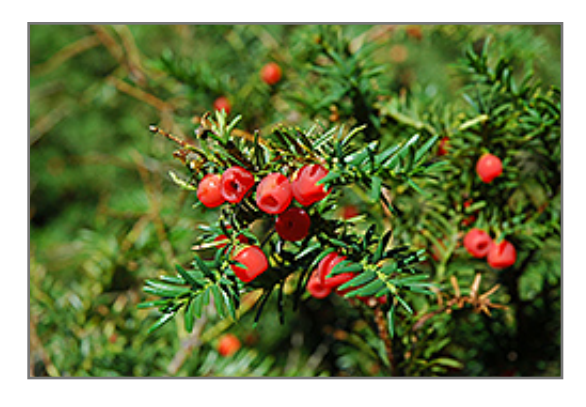
Canadian Yew fruit