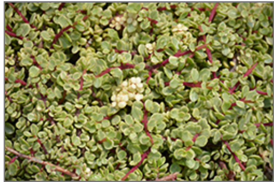
Variegated Elephant Food foliage

Variegated Elephant Food is a fine choice for the garden, but it is also a good selection for planting in outdoor pots and containers. With its upright habit of growth, it is best suited for use as a 'thriller' in the 'spiller-thriller-filler' container combination; plant it near the center of the pot, surrounded by smaller plants and those that spill over the edges. It is even sizeable enough that it can be grown alone in a suitable container. Note that when growing plants in outdoor containers and baskets, they may require more frequent waterings than they would in the yard or garden.