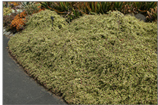
Variegated Elephant Food