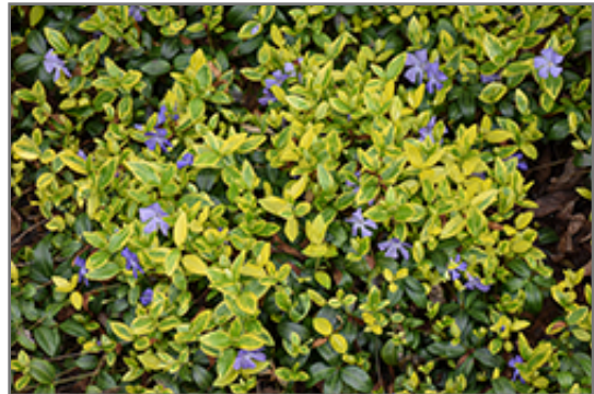
Illumination Periwinkle in bloom

Illumination Periwinkle is an herbaceous evergreen perennial with a ground-hugging habit of growth. Its medium texture blends into the garden, but can always be balanced by a couple of finer or coarser plants for an effective composition.