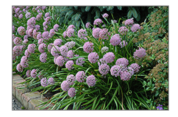
Corkscrew Onion in bloom