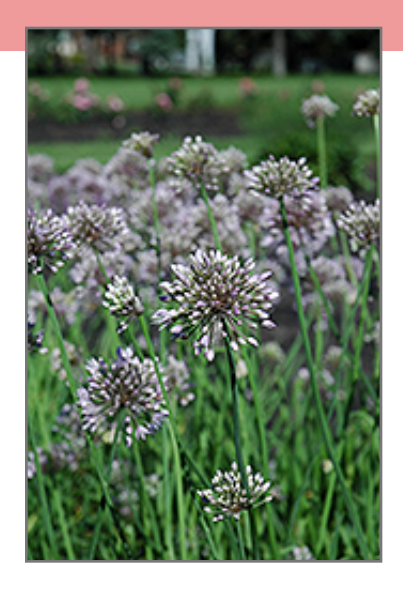
Corkscrew Onion flowers

This is a relatively low maintenance plant. Trim off the flower heads after they fade and die to encourage more blooms late into the season. It is a good choice for attracting butterflies to your yard, but is not particularly attractive to deer who tend to leave it alone in favor of tastier treats. Gardeners should be aware of the following characteristic(s) that may warrant special consideration;