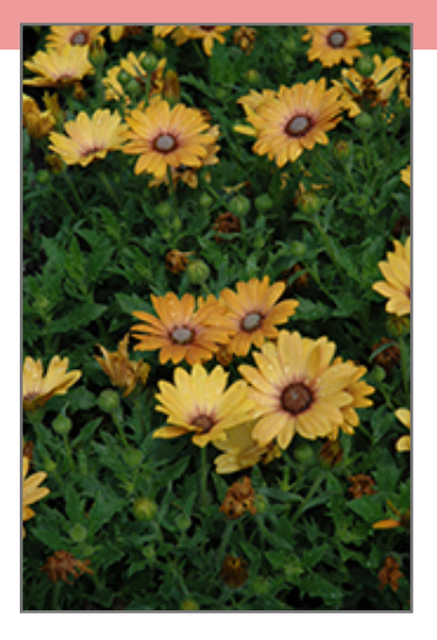
Zion Magic Orange African Daisy flowers