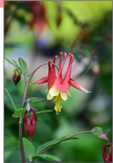
Wild Red Columbine flowers

Wild Red Columbine is recommended for the following landscape applications;