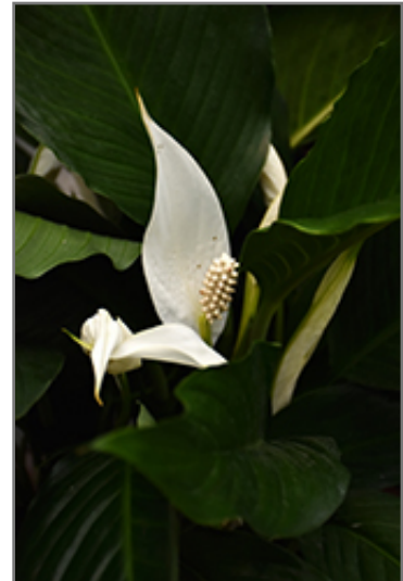
Peace Lily flowers