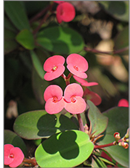
Crown Of Thorns flowers

This is a multi-stemmed evergreen houseplant with an upright spreading habit of growth. This plant may benefit from an occasional pruning to look its best.