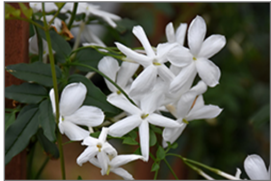
Climbing Jasmine flowers

This is a dense multi-stemmed evergreen houseplant with a spreading, ground-hugging habit of growth. This plant may benefit from an occasional pruning to look its best.