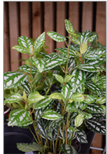
Aluminum Plant foliage