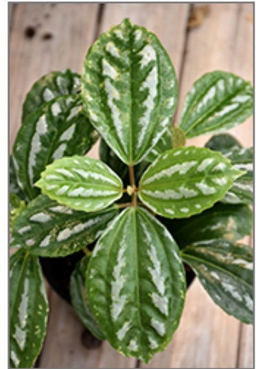
Aluminum Plant in full

There are many factors that will affect the ultimate height, spread and overall performance of a plant when grown indoors; among them, the size of the pot it's growing in, the amount of light it receives, watering frequency, the pruning regimen and repotting schedule. Use the information described here as a guideline only; individual performance can and will vary. Please contact the store to speak with one of our experts if you are interested in further details concerning recommendations on pot size, watering, pruning, repotting, etc.