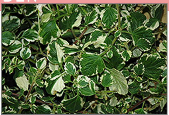
White Surf Plectranthus foliage

When grown indoors, White Surf Plectranthus can be expected to grow to be about 8 inches tall at maturity, with a spread of 24 inches. It grows at a medium rate, and under ideal conditions can be expected to live for approximately 5 years. This houseplant will do well in a location that gets either direct or indirect sunlight, although it will usually require a more brightly-lit environment than what artificial indoor lighting alone can provide. It is very adaptable to both dry and moist soil, but will not tolerate any standing water. The surface of the soil shouldn't be allowed to dry out completely, and so you should expect to water this plant once and possibly even twice each week. Be aware that your particular watering schedule may vary depending on its location in the room, the pot size, plant size and other conditions; if in doubt, ask one of our experts in the store for advice. It is not particular as to soil type or pH; an average potting soil should work just fine.