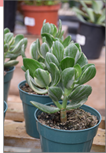
Variegated Jade Plant in full

This is a multi-stemmed evergreen houseplant with an upright spreading habit of growth. This plant can be pruned at any time to keep it looking its best.