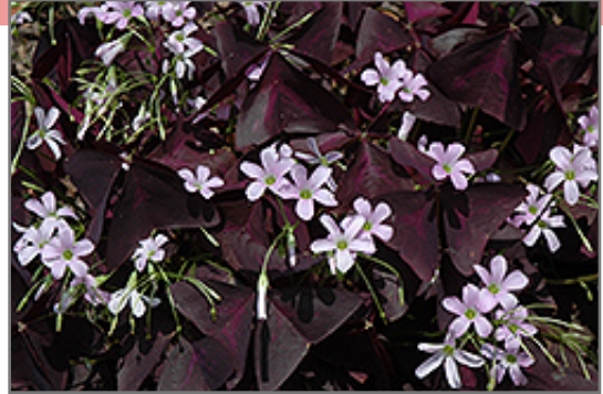
Purple Shamrock flowers