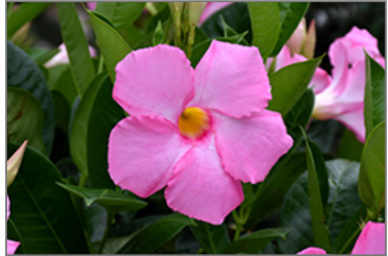
Pink Mandevilla flowers

This is a multi-stemmed evergreen houseplant with a spreading, ground-hugging habit of growth. This plant can be pruned at any time to keep it looking its best.