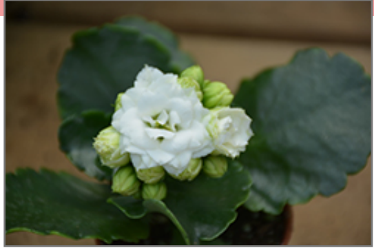
Calandiva White Kalanchoe flowers