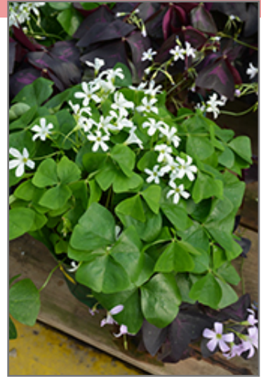
Fanny Shamrock in bloom

When grown indoors, Fanny Shamrock can be expected to grow to be about 12 inches tall at maturity, with a spread of 15 inches. It grows at a fast rate, and under ideal conditions can be expected to live for approximately 10 years. This houseplant performs well in both bright or indirect sunlight and strong artificial light, and can therefore be situated in almost any well-lit room or location. It does best in average to evenly moist soil, but will not tolerate standing water. The surface of the soil shouldn't be allowed to dry out completely, and so you should expect to water this plant once and possibly even twice each week. Be aware that your particular watering schedule may vary depending on its location in the room, the pot size, plant size and other conditions; if in doubt, ask one of our experts in the store for advice. It is not particular as to soil type or pH; an average potting soil should work just fine.