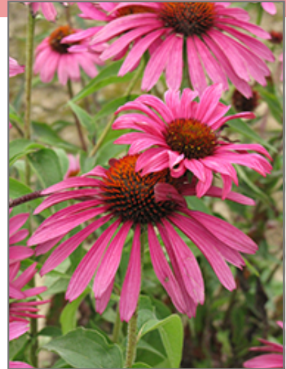
Ruby Star Coneflower flowers