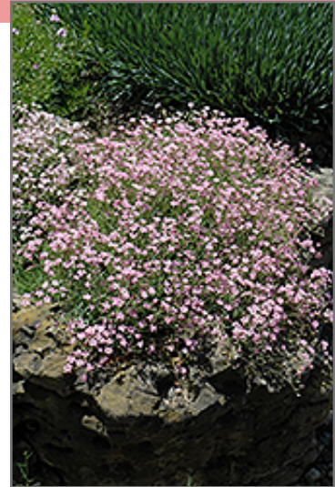
Pink Creeping Baby's Breath in bloom