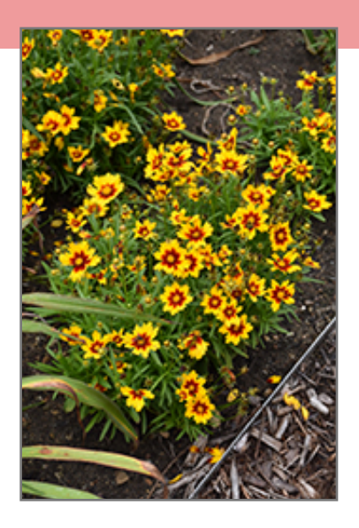
UpTick Gold and Bronze Tickseed in bloom

This plant should only be grown in full sunlight. It does best in average to evenly moist conditions, but will not tolerate standing water. It is not particular as to soil pH, but grows best in poor soils. It is somewhat tolerant of urban pollution. This particular variety is an interspecific hybrid. It can be propagated by division; however, as a cultivated variety, be aware that it may be subject to certain restrictions or prohibitions on propagation.