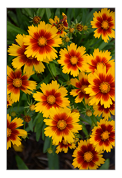
UpTick Gold and Bronze Tickseed flowers