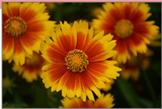
UpTick Gold and Bronze Tickseed flowers

UpTick Gold and Bronze Tickseed is recommended for the following landscape applications;