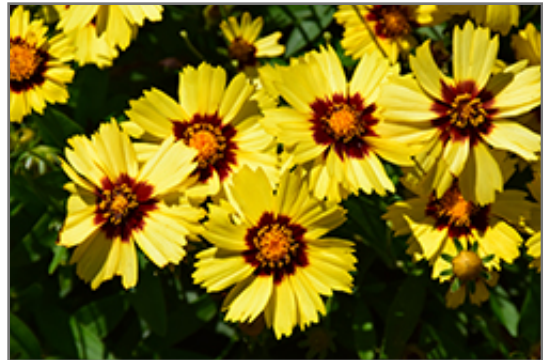
UpTick Yellow and Red Tickseed flowers

This is a relatively low maintenance plant, and is best cleaned up in early spring before it resumes active growth for the season. It is a good choice for attracting bees and butterflies to your yard, but is not particularly attractive to deer who tend to leave it alone in favor of tastier treats. It has no significant negative characteristics.