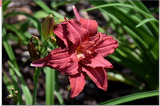
Double Pardon Me Daylily flowers