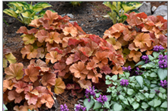
Northern Exposure Amber Coral Bells

Northern Exposure Amber Coral Bells is a dense herbaceous evergreen perennial with tall flower stalks held atop a low mound of foliage. Its relatively fine texture sets it apart from other garden plants with less refined foliage.