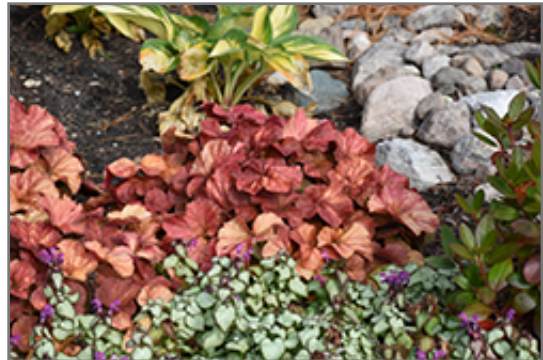
Northern Exposure Amber Coral Bells