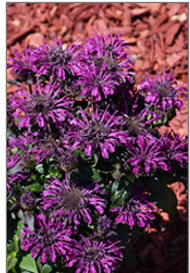
Rockin' Raspberry Beebalm flowers