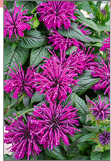
Rockin' Raspberry Beebalm flowers