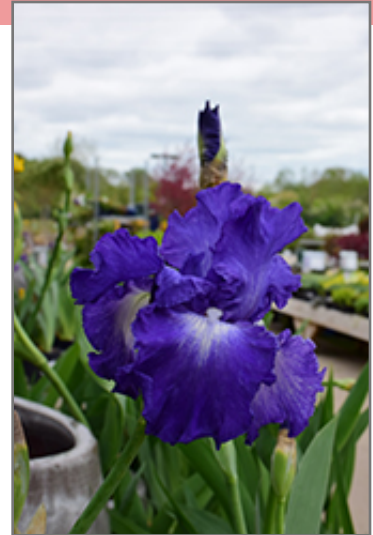
Speeding Again Iris flowers