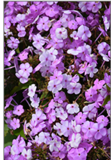
Fashionably Early Princess Garden Phlox flowers

This plant will require occasional maintenance and upkeep, and should be cut back in late fall in preparation for winter. It is a good choice for attracting butterflies and hummingbirds to your yard. Gardeners should be aware of the following characteristic(s) that may warrant special consideration;