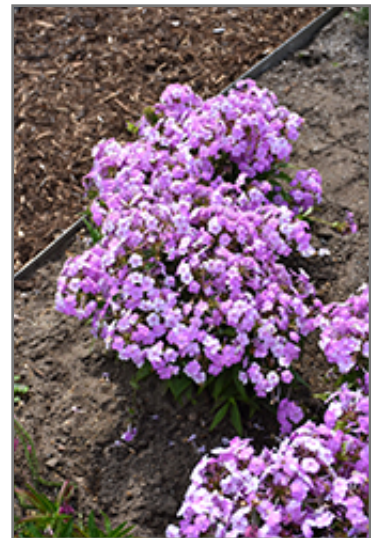
Fashionably Early Princess Garden Phlox in bloom