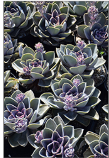
Perle Von Nurnberg Echeveria