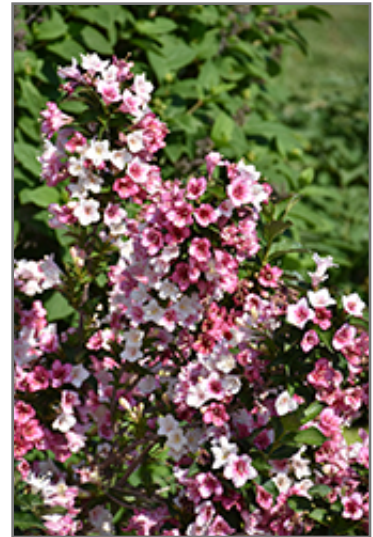
Czechmark Trilogy Weigela flowers

This shrub should only be grown in full sunlight. It prefers to grow in average to moist conditions, and shouldn't be allowed to dry out. It is not particular as to soil type or pH. It is highly tolerant of urban pollution and will even thrive in inner city environments. This is a selected variety of a species not originally from North America.