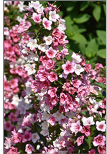
Czechmark Trilogy Weigela flowers

Czechmark Trilogy Weigela is recommended for the following landscape applications;