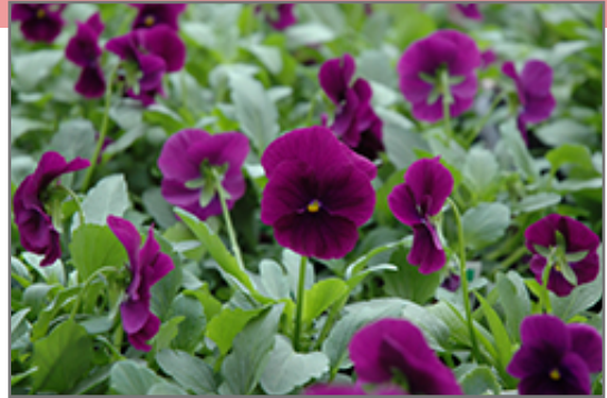
Cool Wave Purple Pansy flowers

Cool Wave Purple Pansy is recommended for the following landscape applications;