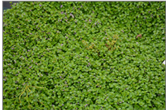
Mini Mint Ornamental Mint