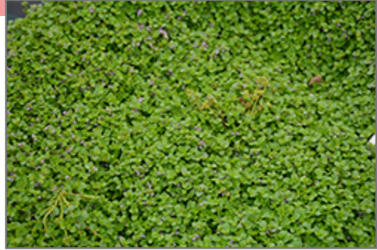
Mini Mint Ornamental Mint

Mini Mint Ornamental Mint is recommended for the following landscape applications;