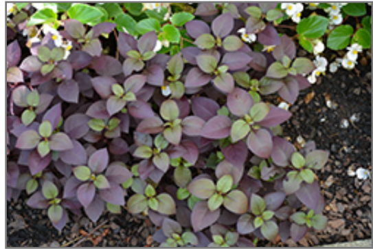
Purple Prince Alternanthera foliage