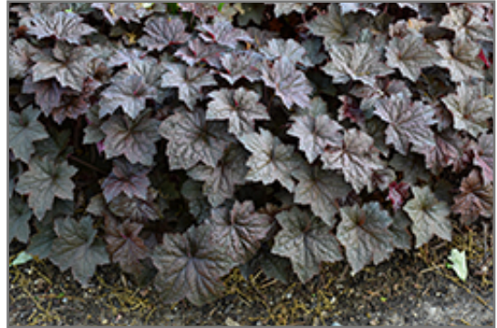
Palace Purple Coral Bells