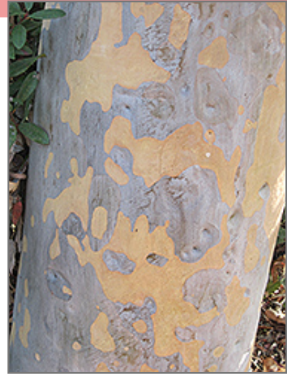
Lemon-scented Gum bark

This tree should only be grown in full sunlight. It prefers dry to average moisture levels with very well-drained soil, and will often die in standing water. It is particular about its soil conditions, with a strong preference for sandy, acidic soils, and is able to handle environmental salt. It is somewhat tolerant of urban pollution. This species is not originally from North America.