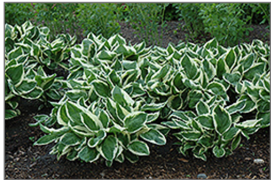
Minuteman Hosta