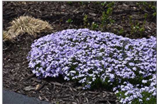
Spring Blue Moss Phlox in bloom

Spring Blue Moss Phlox is a dense herbaceous evergreen perennial with a ground-hugging habit of growth. It brings an extremely fine and delicate texture to the garden composition and should be used to full effect.