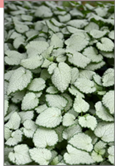
Red Nancy Spotted Dead Nettle foliage

Red Nancy Spotted Dead Nettle is a fine choice for the garden, but it is also a good selection for planting in outdoor pots and containers. Because of its spreading habit of growth, it is ideally suited for use as a 'spiller' in the 'spiller-thriller-filler' container combination; plant it near the edges where it can spill gracefully over the pot. Note that when growing plants in outdoor containers and baskets, they may require more frequent waterings than they would in the yard or garden.