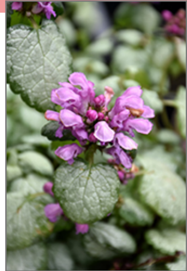
Red Nancy Spotted Dead Nettle flowers