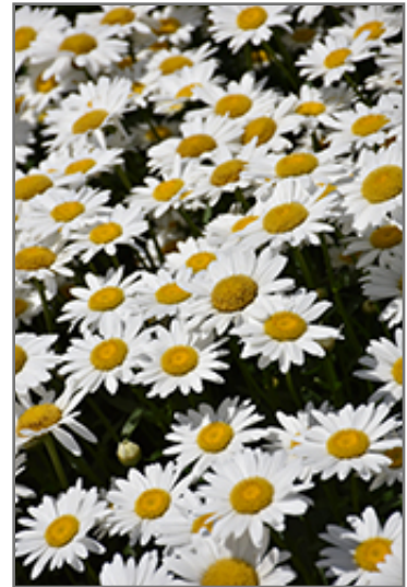
Becky Shasta Daisy flowers