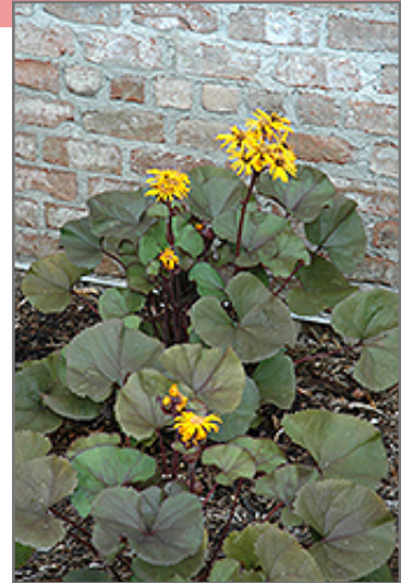
Britt Marie Crawford Rayflower in bloom