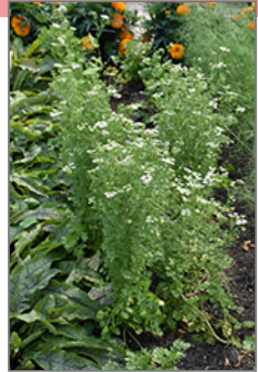
Santo Cilantro in bloom

This plant is typically grown in a designated herb garden. It does best in full sun to partial shade. It does best in average to evenly moist conditions, but will not tolerate standing water. It is not particular as to soil pH, but grows best in rich soils. It is somewhat tolerant of urban pollution. This is a selected variety of a species not originally from North America.