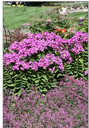
Garden Girls Cover Girl Garden Phlox in bloom