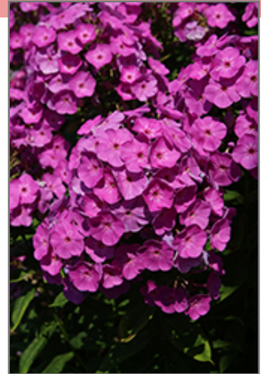
Garden Girls Cover Girl Garden Phlox flowers

Garden Girls Cover Girl Garden Phlox is recommended for the following landscape applications;