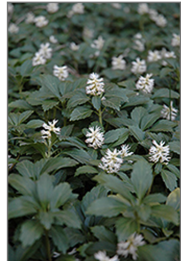
Japanese Spurge flowers