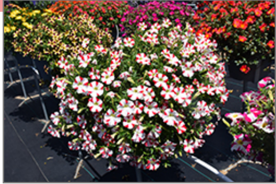
Amore King of Hearts Petunia in bloom

Amore King of Hearts Petunia will grow to be about 12 inches tall at maturity, with a spread of 14 inches. When grown in masses or used as a bedding plant, individual plants should be spaced approximately 10 inches apart. Its foliage tends to remain dense right to the ground, not requiring facer plants in front. This fast-growing annual will normally live for one full growing season, needing replacement the following year.