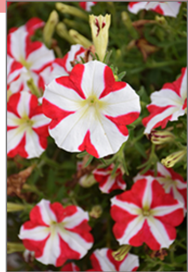
Amore King of Hearts Petunia flowers

Amore King of Hearts Petunia is recommended for the following landscape applications;