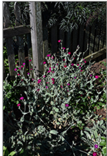
Rose Champion in bloom