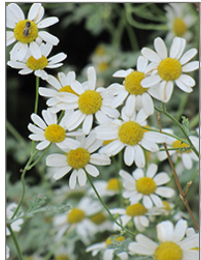
German Chamomile flowers