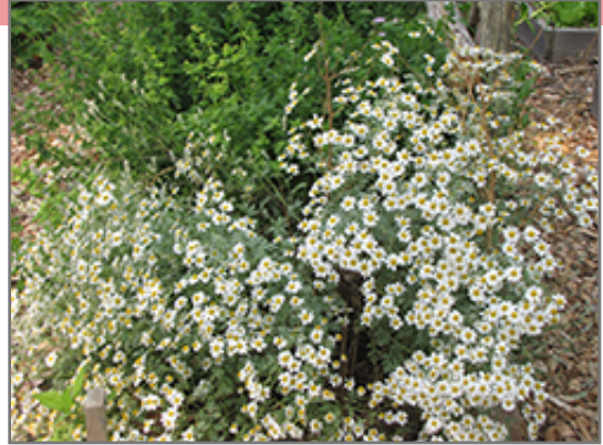
German Chamomile

This plant is quite ornamental as well as edible, and is as much at home in a landscape or flower garden as it is in a designated herb garden. It does best in full sun to partial shade. It is very adaptable to both dry and moist locations, and should do just fine under typical garden conditions. It is not particular as to soil type or pH. It is somewhat tolerant of urban pollution. This species is not originally from North America.