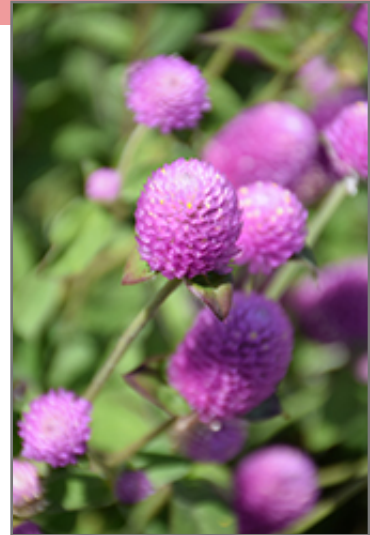
Ping Pong Lavender Globe Amaranth flowers

Ping Pong Lavender Globe Amaranth is recommended for the following landscape applications;