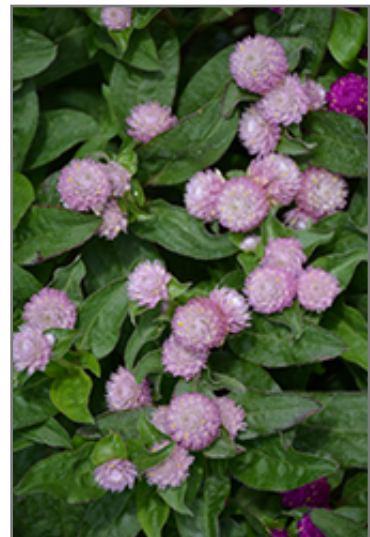
Ping Pong Lavender Globe Amaranth flowers