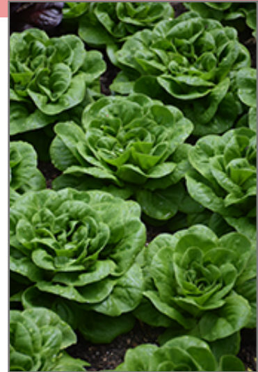
Buttercrunch Lettuce

Buttercrunch Lettuce will grow to be about 12 inches tall at maturity, with a spread of 6 inches. When planted in rows, individual plants should be spaced approximately 8 inches apart. This vegetable plant is an annual, which means that it will grow for one season in your garden and then die after producing a crop. Because of its relatively short time to maturity, it lends itself to a series of successive plantings each staggered by a week or two; this will prolong the effective harvest period.