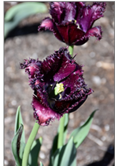
Black Parrot Tulip flowers